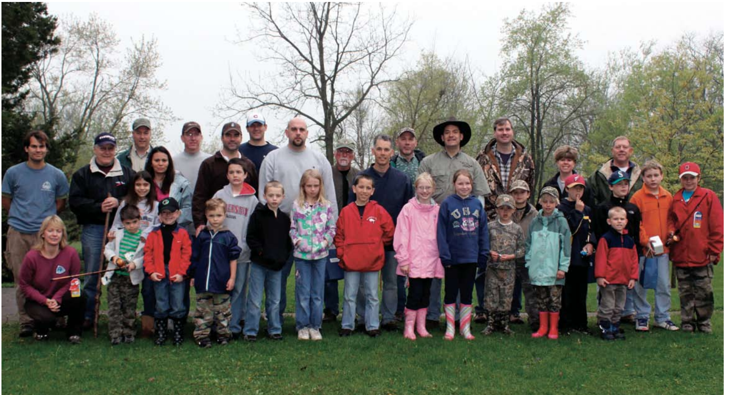
Ducks Unlimited brings adults and children together to raise money for wildlife preservation and educate about the importance of wildlife conservation.