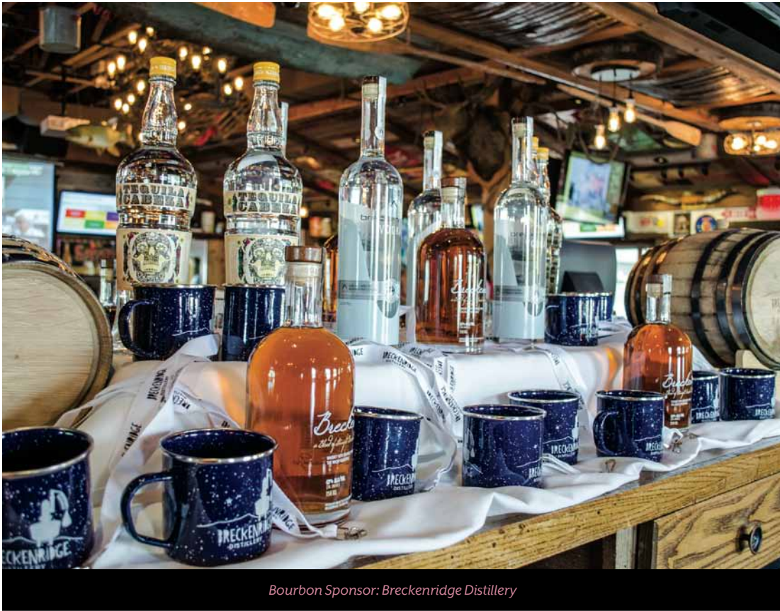
Bourbon Sponsor: Breckenridge Distillery