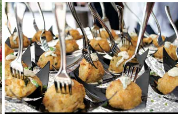
Food provided by: Sweet Caroline's Bar-N-Que