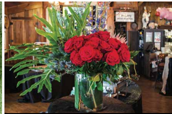
Flower Sponsor: Twisted Stem, Crystal Lake