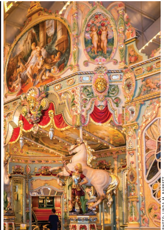
The Eden Palais