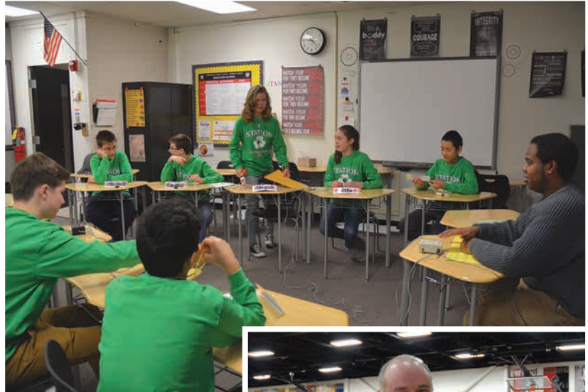
The moderator prepares for the competition.