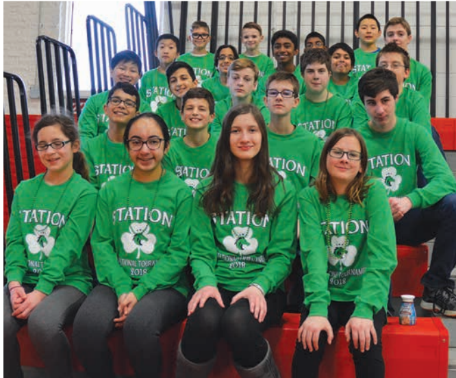
The Barrington Station Scholastic Bowl Team