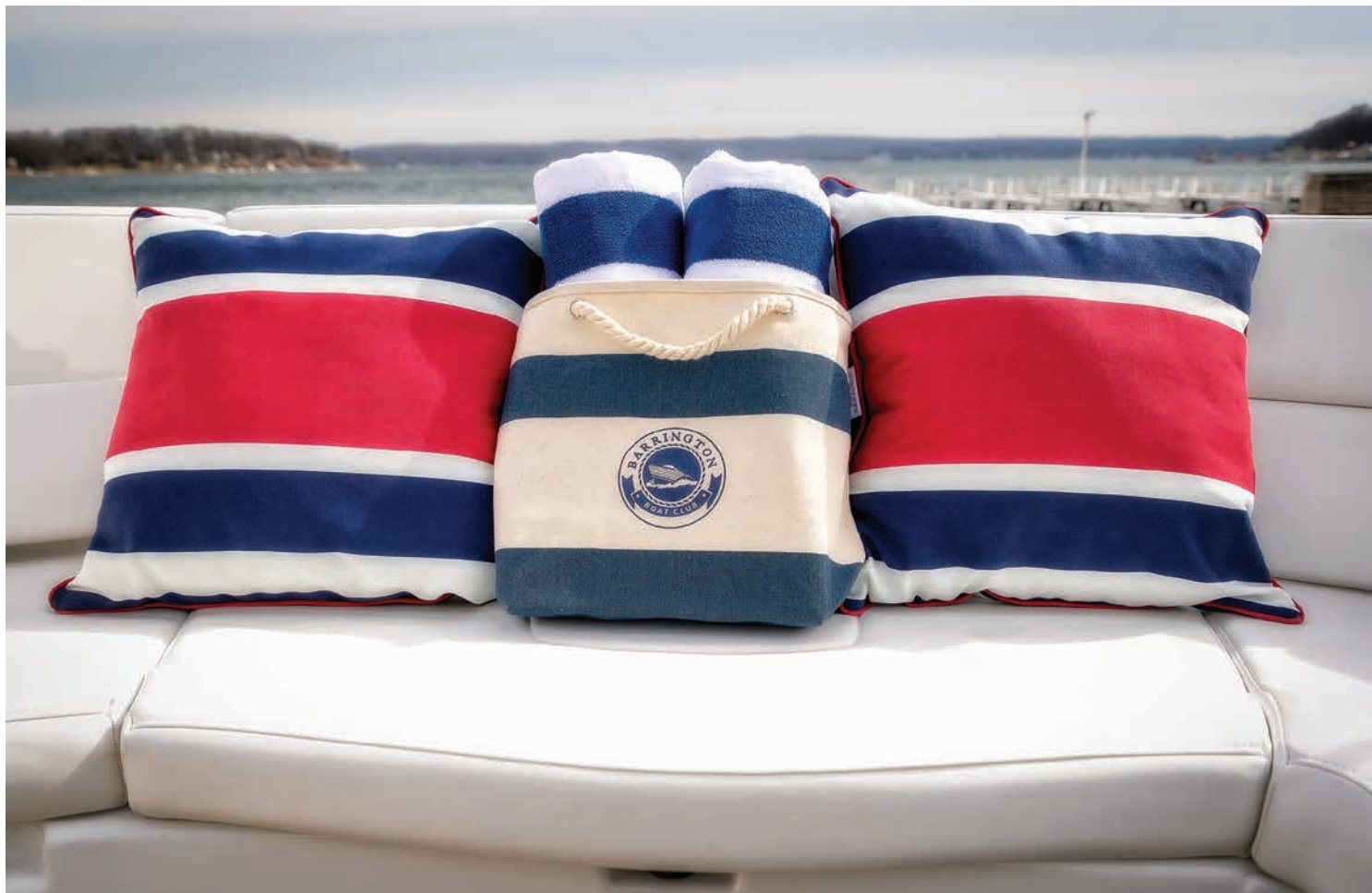
The images presented on both pages are of a 22-foot Monterey 22SF, ideal for cruising and water sports.